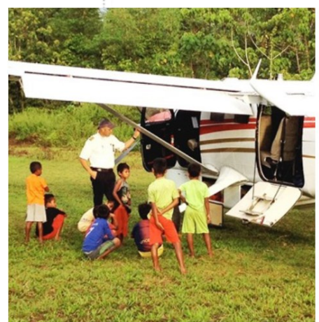
Pappy gives village children a close-up view.